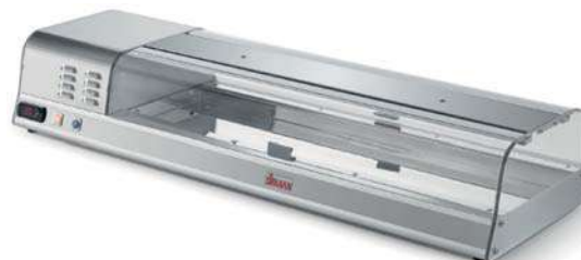
VISTA EASYCOLD 130