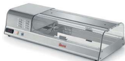
VISTA EASYCOLD 100